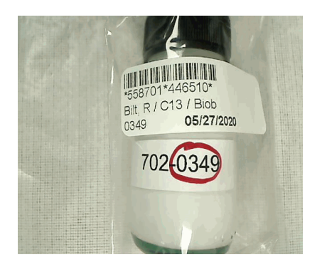
Package received - labeling COC