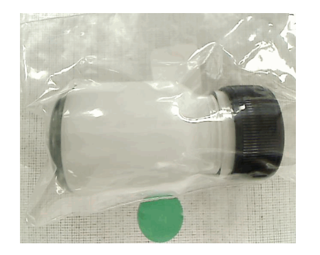
View of content (1mm x 1mm scale)